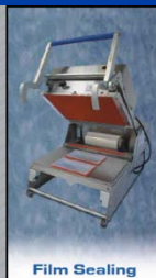
Film Sealing Equipment

PACKAGING WITH PURPOSE INNOVATION TAKING FORM