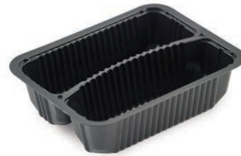
6277 2 Cmpt Dual Ovenable Hamburger Tray CPET